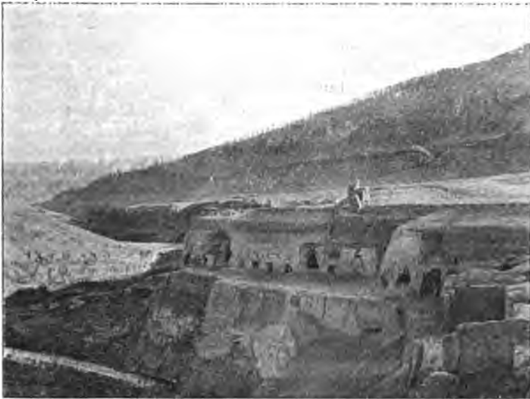
OLD BUDDHIST MONASTERY EXCAVATED ON THE SOFT ALLUVIAL TERRACES OF THE UPPER END OF THE MURTUKEH CAÑON NORTH OF KARA KHOJA, IN THE FIRE MOUNTAINS.

Looking at Turfan as a whole, the scenery of the basin is uninteresting. The lake is a mere mucky salt swamp; the plain, except where there are villages, is a monotonous expanse of reedy stubble and clay, with a little camel-thorn; the gravel slopes are dreary wastes of barrenness; the Sand mountains, though striking, are peculiarly sombre, by reason of the dark grey and deep purple shades of the long slopes. They lack the delicate details so beautiful in sand deposits of lighter weight and colour. The Desert mountains on the south are so flat-topped and subdued in general outline that one gladly turns from them;