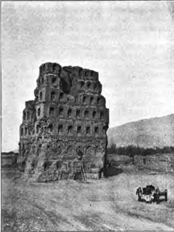
SACRED BUDDHIST TOWER AT SIRKIP, AT THE FOOT OF THE FIRE MOUNTAINS NEAR LUKCHUN. EACH NICHE CONTAINED A LIFE-SIZE FIGURE OF BUDDHA IN HIGH RELIEF. FANATICAL MOBLEMS HAVE DESTROYED AT LEAST THE HEADS OF ALL THE FIGURES.

“ If the Wang should see her at the wedding, and know that she had