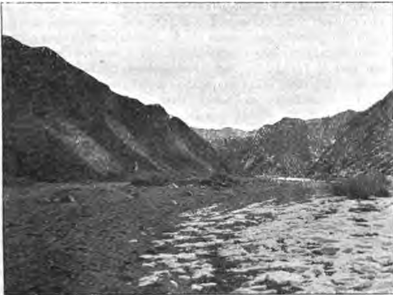
A VALLEY IN THE CHOL TAGH, OR DESERT MOUNTAINS, SOUTH OF TURFAN. ICE IN THE FOREGROUND.