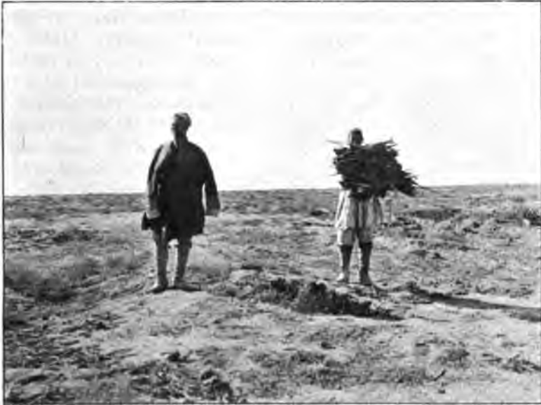
YOUNG MEN OF TURFAN DIGGING THE STALKS OF REEDS WHICH DIED CENTURIES AGO AND ARE NOW TO BE USED AS FUEL. THE FEATHERY WEEDS ARE CAMEL-THORN.

The structure of the Fire mountains will be readily understood from the cross-section on p. 254. At a very recent date, geologically speaking, a fault or dislocation (A-B in the cross-section) took place along an east-and-west line parallel to the Bogdo range and about 40 miles from the main crest. North of the fault a long narrow strip of the Earth's crust about 5 miles wide was uplifted and tilted so that it dipped northward. To the south the plain of fine soil dropped to a lower level, and the