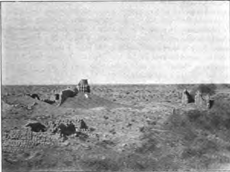
THE OLD BUDDHIST MONASTERY OF KUHIK ASSA (LITTLE ASSA), SHOWING THE TURFAN PLAIN DOTTED WITH CAMEL-THORN. SAND HAS HALF BURIED SOME OF THE BUILDING.