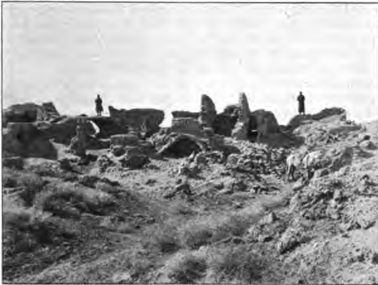
VIEW LOOKING WESTWARD IN THE INNER FORT OF THE RUINS OF CHOUG ASSA (LARGE ASSA). THE HOUSES, LIKE THOSE OF EASTERN PERSIA, ARE MADE ENTIRELY OF ADOBE BRICKS WITHOUT THE USE OF WOOD EVEN IN THE DOMED ROOFS.

At Turfan, however, there is a series of alternating lacustrine and non-lacustrine deposits, which indicate that previous to the series of decreasingly severe fluvial epochs mentioned in the last paragraph, there was a similar series of increasingly severe epochs. The deposits consist in part of pale greenish strata of solid clay, which was evidently deposited in the deep water of a large lake, the expansion of the present plays of Böjanti. At top and bottom these typical lacustrine strata pass into