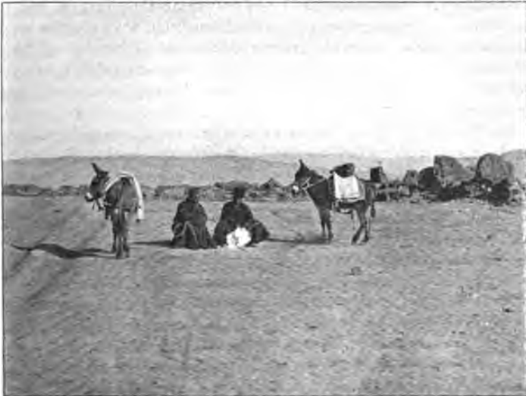
SCENE IN THE RUINS OF KARA KHOJA. IN THE NEAR BACKGROUND RISES THE RED ESCARPMENT OF THE FIRE MOUNTAINS, BEHIND WHICH CAN BE SEEN THE SNOW-CAPPED BOGDO RANGE.

All the people with whom I talked said substantially the same thing, provided they had any idea at all about the matter. On the whole, it seems safe to conclude that the "kariz" is, comparatively speaking, an innovation in Turfan, and that the greater density of population in ancient times was not made possible by its more general use. On the contrary, under its stimulus there has been a marked increase in population during the last century, as I was told again and again. As nearly as I could ascertain, the population of the entire Turfan basin consists of 9500 families, or 50,000 souls. Of these, 5400 families are supported by